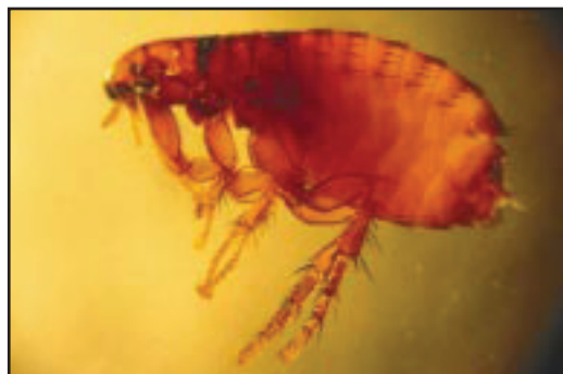
Cat fleas are the most common fleas on dogs and cats. They also infest raccoons, opossums and coyotes.

Cat fleas do not normally live on humans, but do bite people who handle infested animals. Flea bites